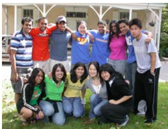
APALI Fall 2004